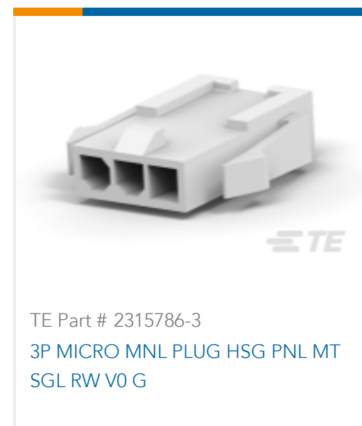
TE Part # 2315786-3 3P MICRO MNL PLUG HSG PNL MT SGL RW V0 G