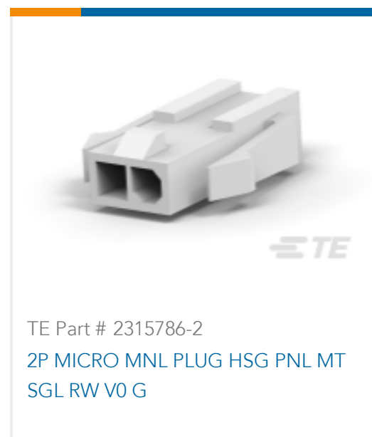
TE Part # 2315786-2 2P MICRO MNL PLUG HSG PNL MT SGL RW V0 G