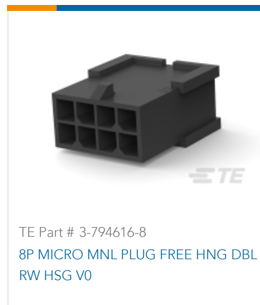
TE Part # 3-794616-8 8P MICRO MNL PLUG FREE HNG DBL RW HSG V0