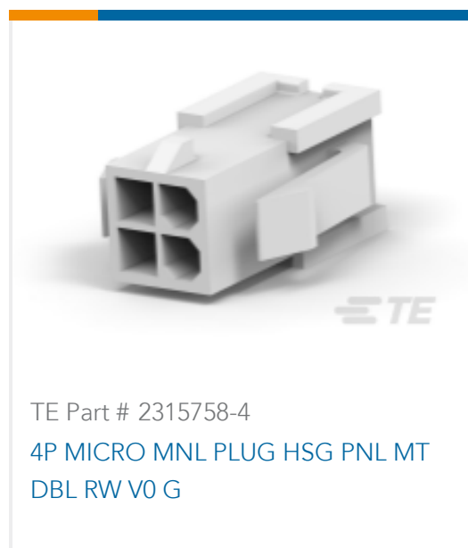
TE Part # 2315758-4 4P MICRO MNL PLUG HSG PNL MT DBL RW V0 G