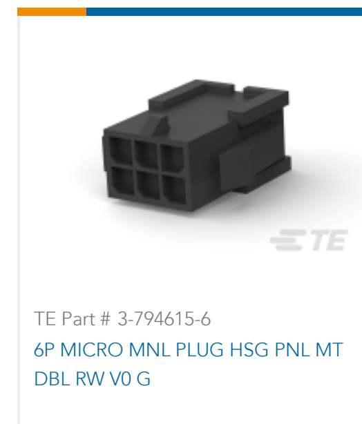
TE Part # 3-794615-6 6P MICRO MNL PLUG HSG PNL MT DBL RW V0 G