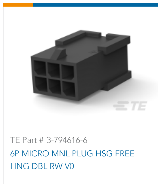
TE Part # 3-794616-6 6P MICRO MNL PLUG HSG FREE HNG DBL RW V0